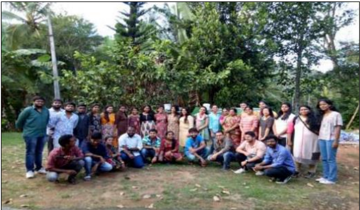
Students of batch 2016-18 during OBT at Shreyas, Wayanad